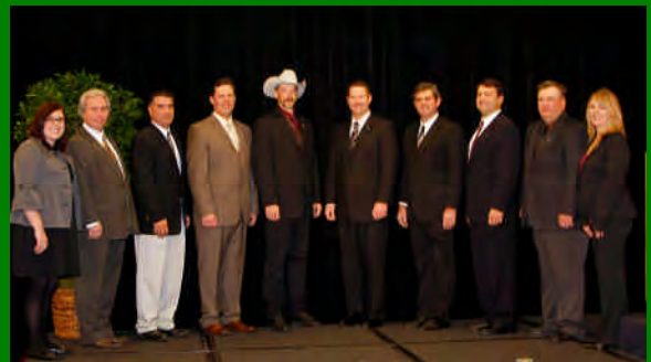
Leadership Farm Bureau Class of 2009

Applications for the class of 2010 can be found at CFBF.com and are due by October 15, 2009.